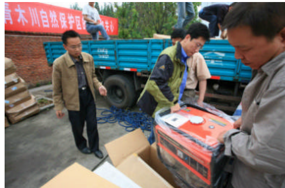
Rescue relief delivered to Qingmuchuan Nature Reserve

The first batch of rescue materials including tents, generator, candles and medicines was delivered to Shaanxi Qingmuchuan Nature Reserve on May 21 by Xi'an Office staff, helping the staff and community villager to pass the most difficult period. After this, WWF sent another 100 tents, clothes, torches, etc to the other affected nature reserves in Qinling.