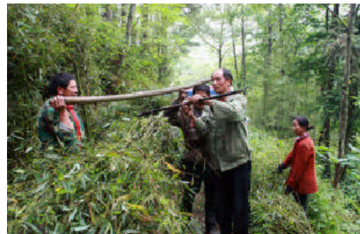
Weighing bamboo for the pandas

With Coca Cola company's support, the Sichuan Forest Department purchased the fresh bamboo in Baoxing County where peasants sold it at preferentially low prices. It takes at least 12 hours to transport the bamboo in trucks from Baoxing to Wolong and careful consideration was given to make the delivered bamboo as fresh as possible.