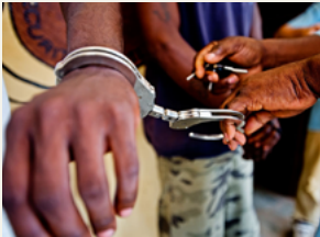
Seized Shipment of Illegal African Elephant Tusks, Thailand

The lack of oversight of the market and legal deterrents can fuel illegal behaviour, detracting from the effectiveness of a ban