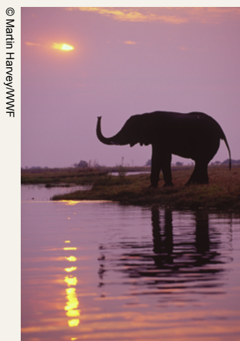
African elephant raising trunk to test air for smell in the Moremi Game Reserve, Okovango Delta, Botswana

There are three sources of ivory in the Chinese legal market: (1) ivory that was legally imported into China before 1991, when the CITES international ivory trade ban came into effect in China; (2) imports of pre-CITES, or pre-Convention ivory; and (3) ivory from the 2008 CITES-approved one-off sale in which China imported 62 tonnes of raw ivory. Five State-owned enterprise (SOEs), out of a total of 34 licensed ivory factories, hold most 24 of the remaining stocks of raw ivory.