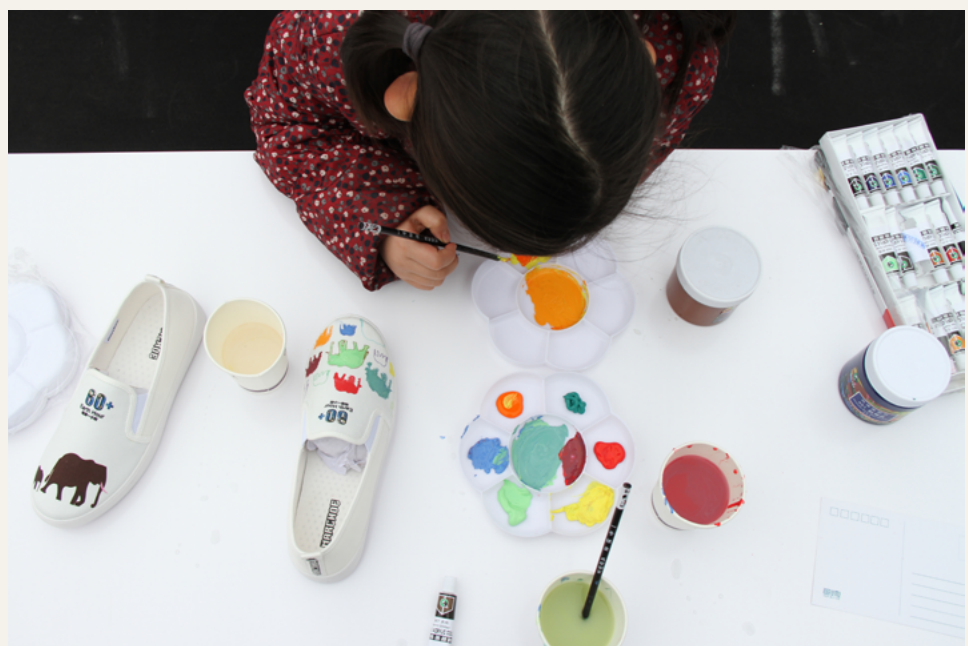
Shanghai, China, Earth Hour 2016 - a mural featuring "No illegal wildlife trade—draw a colourful world" attracted local children

For a sustainable China and a more climate-friendly world, the government of China has taken decisive actions to, for example, eliminate or restructure polluting and outdated facilities and enhance energy use and efficiency, which has affected many enterprises and jobs. A recent report estimated the economic cost of China's efforts to save energy and cut emissions of harmful pollutants during 2006-2010 with US$29 billion 26 . Compared to this, the impact of an ivory trade ban on the economy would be miniscule, while the benefits for China – including for its international reputation – will be significant. China's efficient policy-making system could allow implementation of a ban to occur rapidly throughout the country.