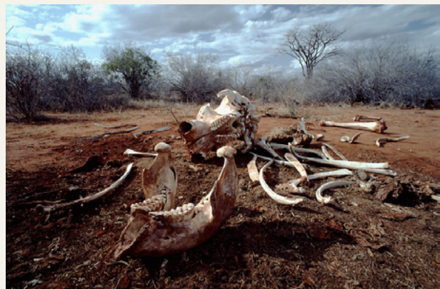
African elephant bones, from ivory poaching. Kenya, Tsavo National Park

WWF and TRAFFIC do not expect an expiry date on the ivory trade ban, since it will take a long time and a wide range of global efforts to eliminate all threats to African elephants. An expiry date could create an expectation that ivory trade would return at some point in future, thereby encouraging the stockpiling of ivory.